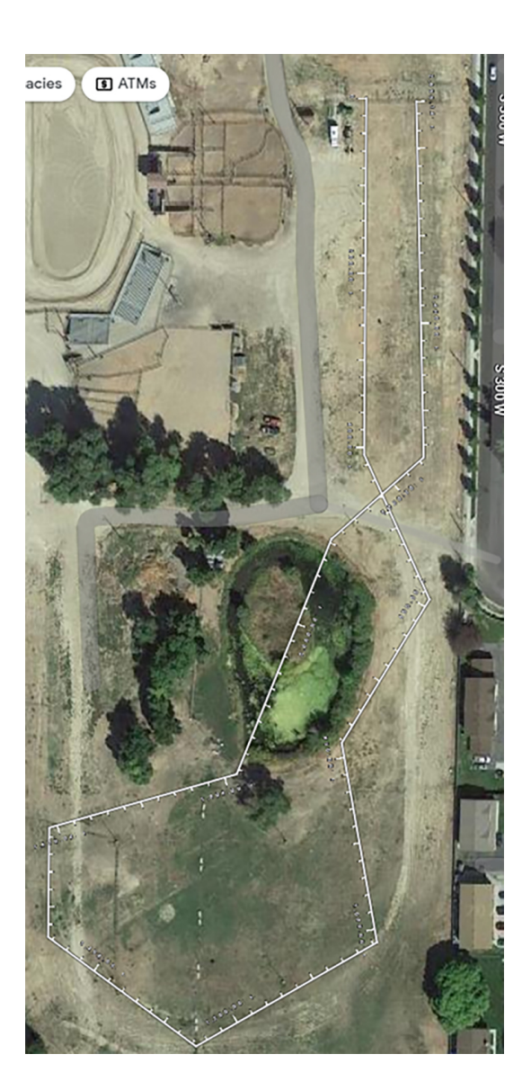
Course Plan – ~885 Yards The course will be reversed for finals and again for runoffs and Best of Breed

All Scottish Deerhounds must be <u>certified prior to the closing date</u> of entries in an ASFA trial. If this is the first trial for your Scottish Deerhound, the judge-signed <u>certification form</u> or <u>waiver</u> (with proof of title) as well as a copy of the hound's registration certificate MUST accompany your entry.